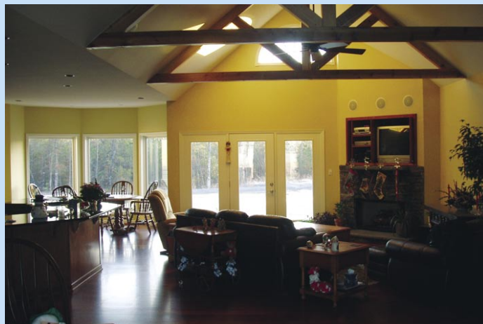
Sky Country Lodge offers comfortable surroundings for pilots in Koontz's aerobatics school.

and to feel that they have more control over the airplane, that it is not taking them for a ride, but that they are controlling it." A graduation certificate from the basic aerobatics course will earn students a 10 percent discount on their insurance.